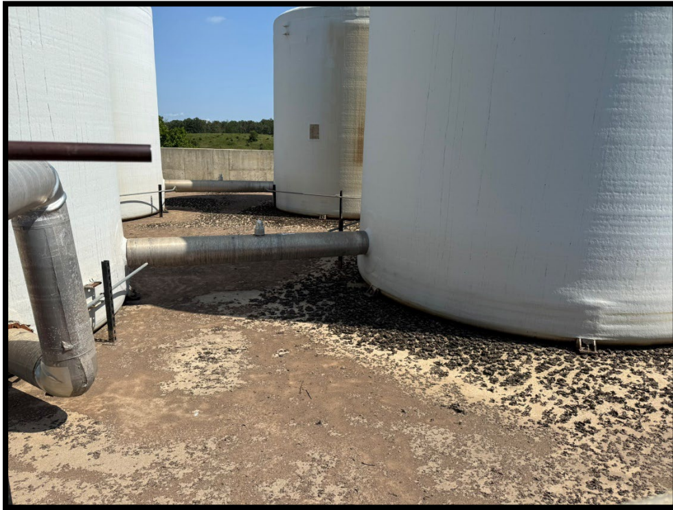
Photograph 3: View of no stormwater in containment.