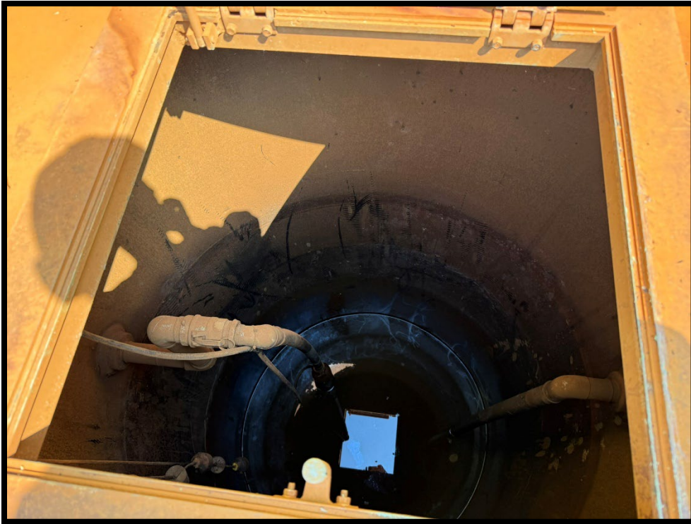
Photograph 1: View of VLCS-1 sump level.