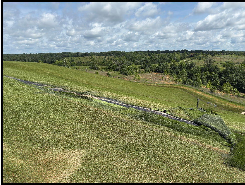
Photograph 5: View of damaged closure turf on east side of Area 1-3.