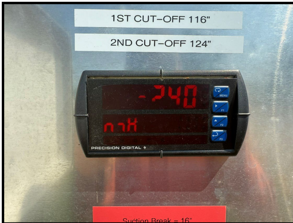
Photograph 2: View leachate tank level indicator.