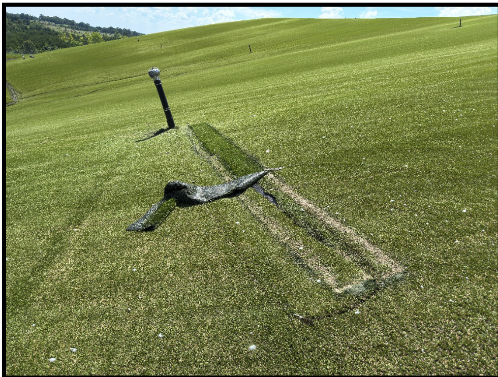
Photograph 4: View of damaged closure turf on the north side of Area 1-2.